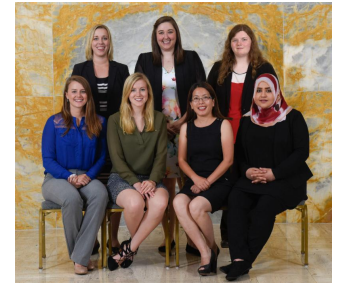
Mayo Clinic's Class of 2017

A new formatted CSA Exam comes to fruition! An October release date is expected.