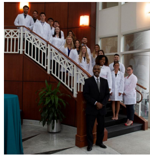
EVMS Masters of Surgical Assisting Class of 2018