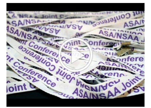
1st Annual ASA/NSAA Conference

Check out of the Conference Highlight Slideshow!